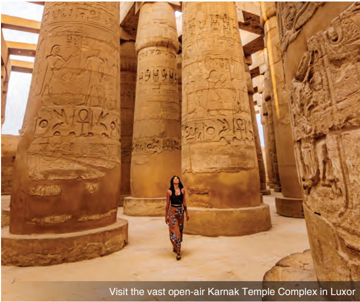
Visit the vast open-air Karnak Temple Complex in Luxor