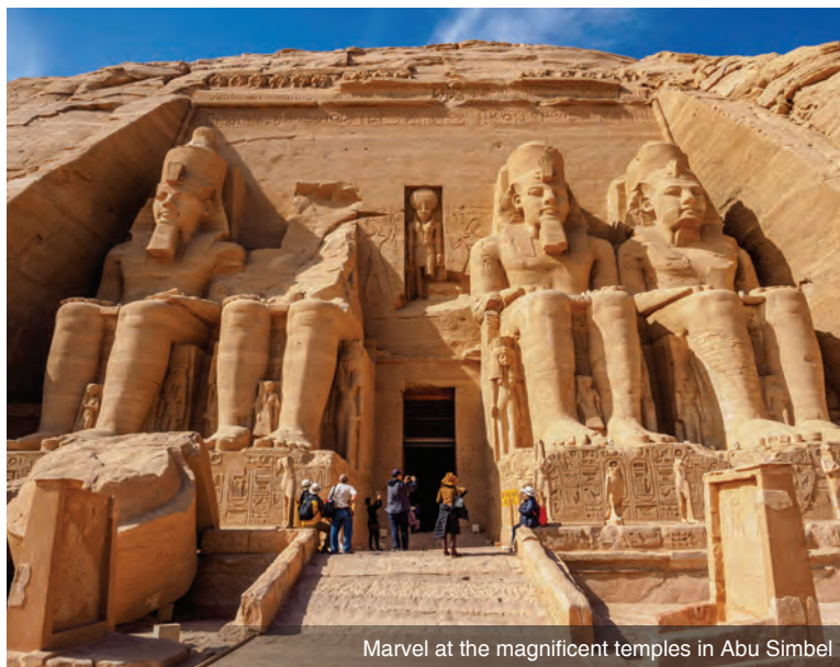
Marvel at the magnificent temples in Abu Simbel

Egypt, but it is the second largest after Karnak. In the afternoon, sail to Kom Ombo, a pleasant agricultural town and home to many Nubians. Enjoy a cooking class onboard as you sail to the next port. Upon arrival, visit the unusual Temple of Kom Ombo dedicated to both Horus and the crocodile god Sobek. After re-embarking, the ship sails for Aswan. Relax on the Sun Deck as you cruise along the Nile. Meals: B, L, D