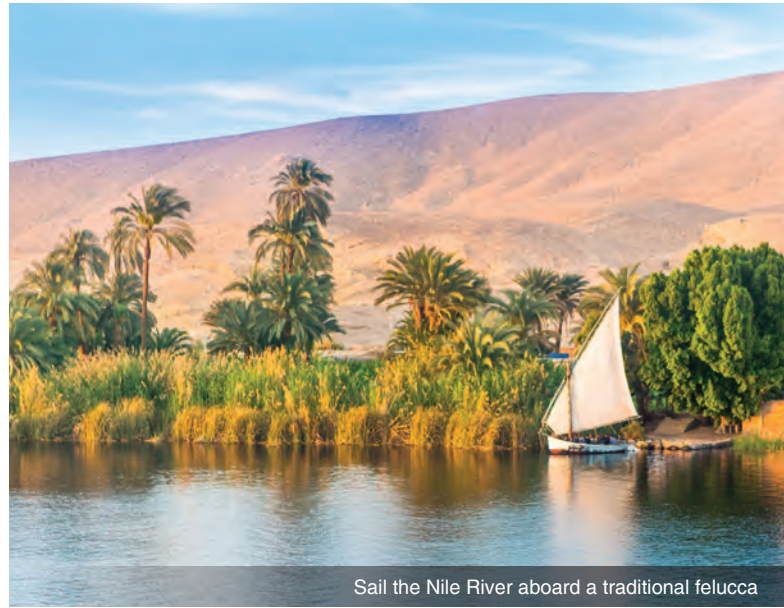
Sail the Nile River aboard a traditional felucca

DAY 1 Depart the USA: Depart the USA on your transatlantic overnight flight to Cairo, Egypt.